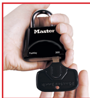
2 Let Go