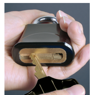
Exclusive key guide directs key to keyway