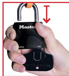
3 Pull Down